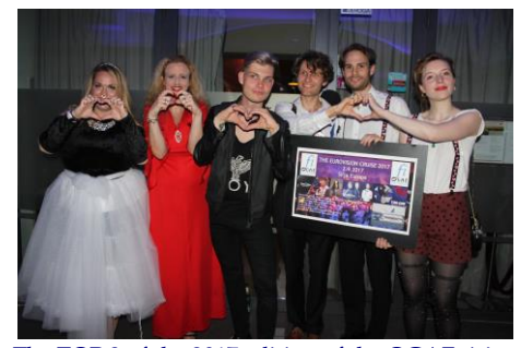
The TOP 3 of the 2017 edition of the OGAEvision Song Contest: Israel, Sweden and Finland

The fan club chooses the participant to represent his fan club, so in the OGAEvision Song Contest singers from twelve different countries compete for the trophy, backed by their national fan clubs.